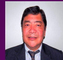
PDS Abo Gempesaw